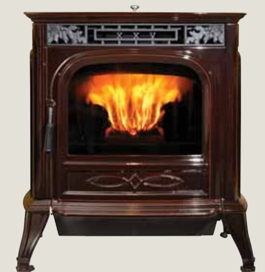
XXV shown with optional Majolica Brown enamel

The XXV has a remarkably precise temperature control system built right in so you won't need an old-fashioned thermostat. The Harman XXV constantly monitors room temperatures and makes automatic adjustments to the pellet feed rate and combustion air so you get very even heating. It even turns off and on as needed. Your home is kept warm and comfortable without the rapid fluctuations in temperatures common to other pellet stoves. The XXV is so advanced it will keep the room temperature just where you want it, regardless of the quality of pellets you burn or the frequency you clean your stove.